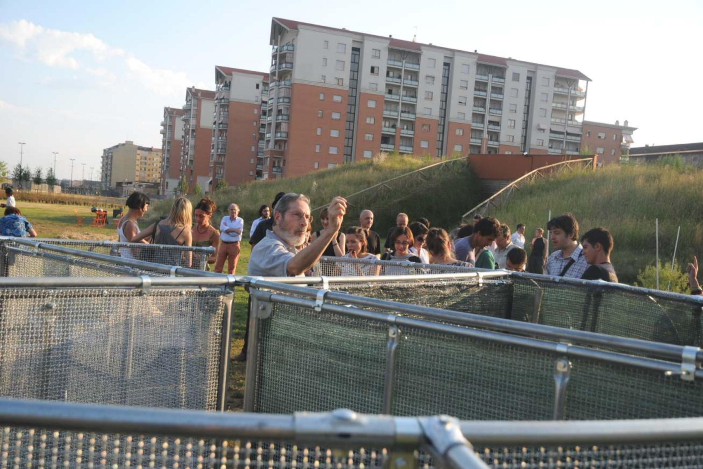
Trasmuter of Organic Matter_Opening - 18th june 2009