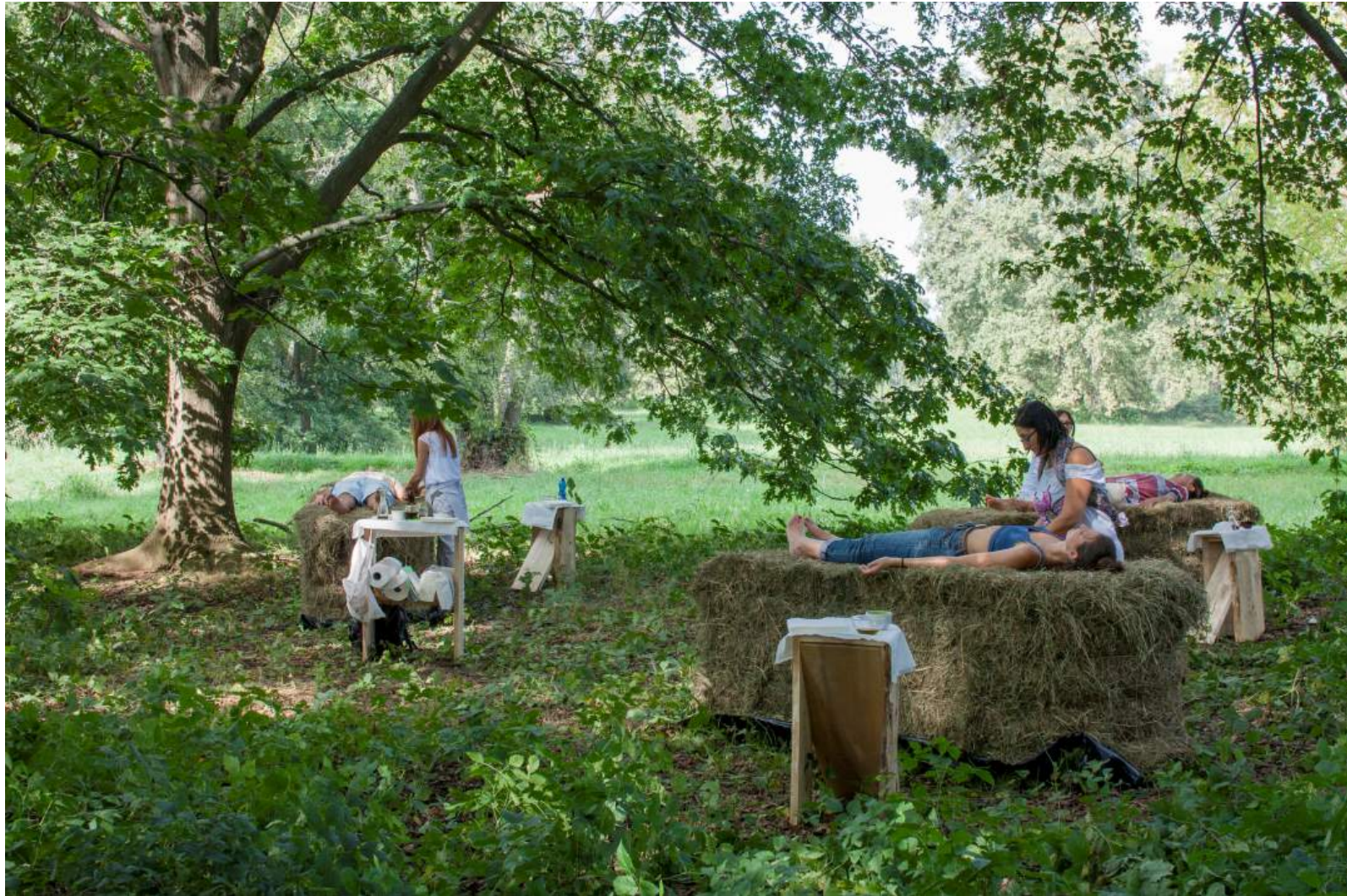
EPIDERMA_happening , Stupinigi Park, Nichelino (Turin), 20th September 2014