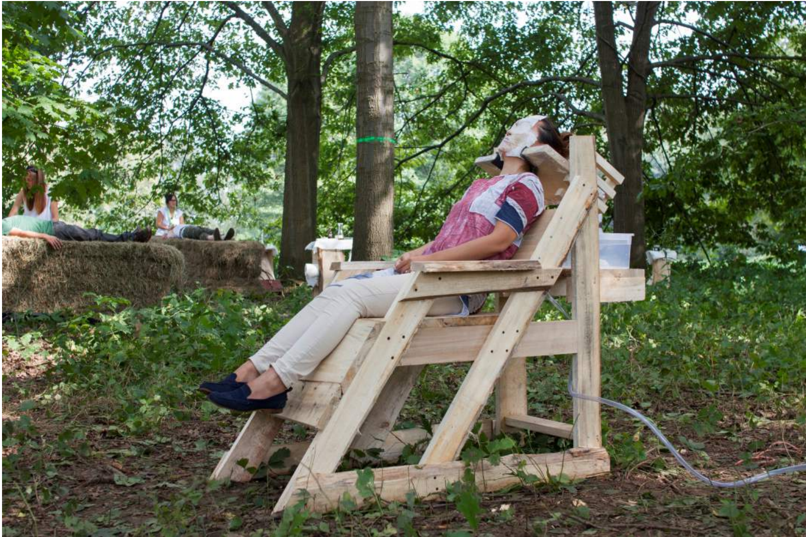
EPIDERMA_happening , Stupinigi Park, Nichelino (Turin), 20th September 2014