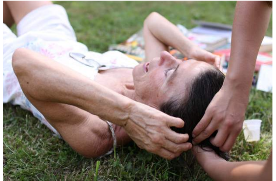
EPIDERMA _workshop, Stupinigi Park, Nichelino (Turin), June 2014