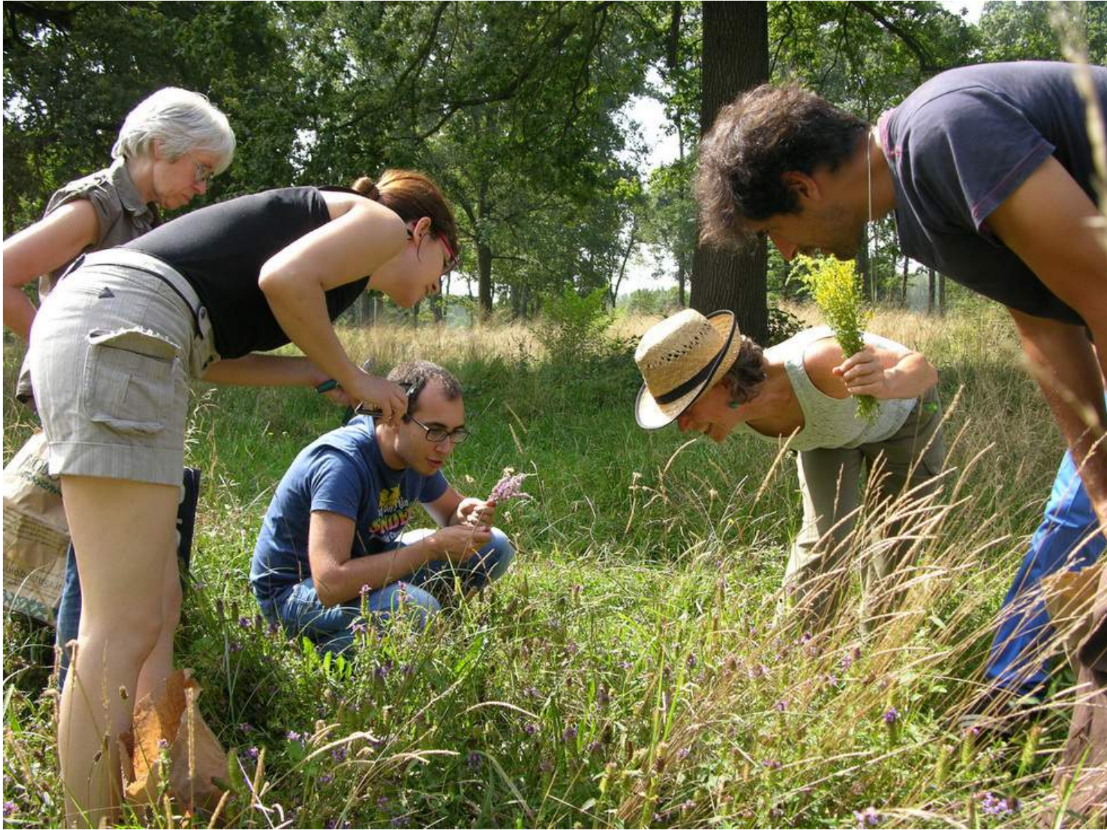
EPIDERMA - workshop at Stupinigi Park, Nichelino (Torino), August 2014