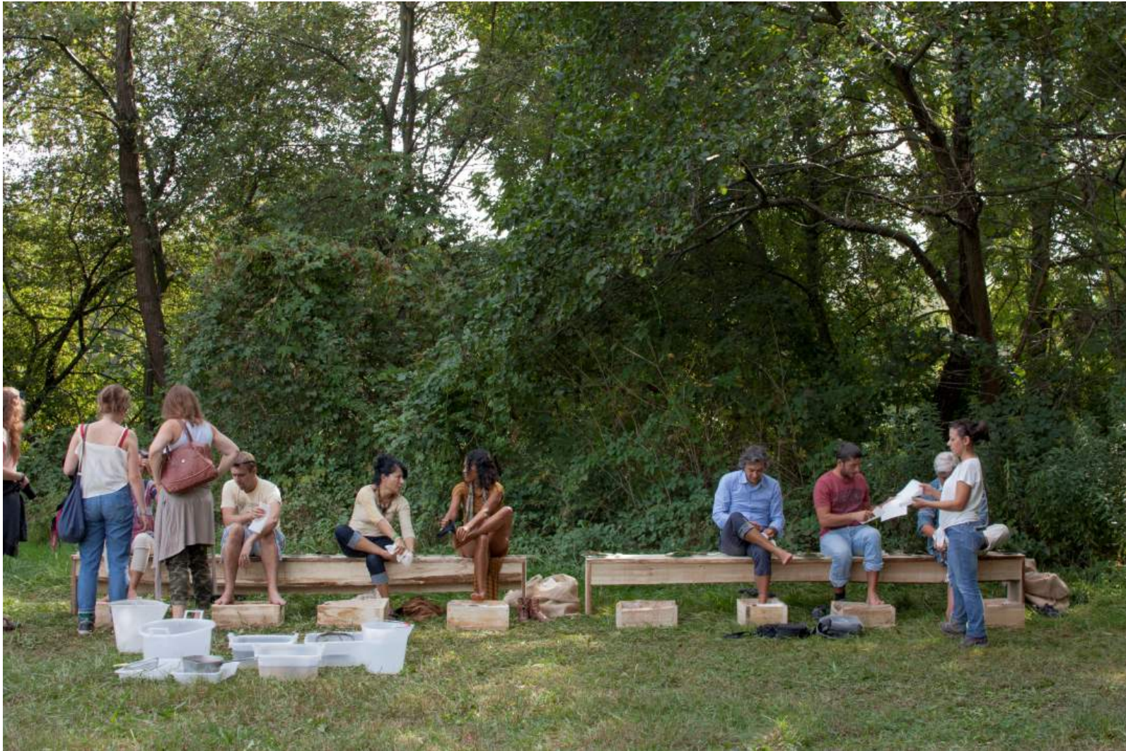
EPIDERMA_happening , Stupinigi Park, Nichelino (Turin), 20th September 2014