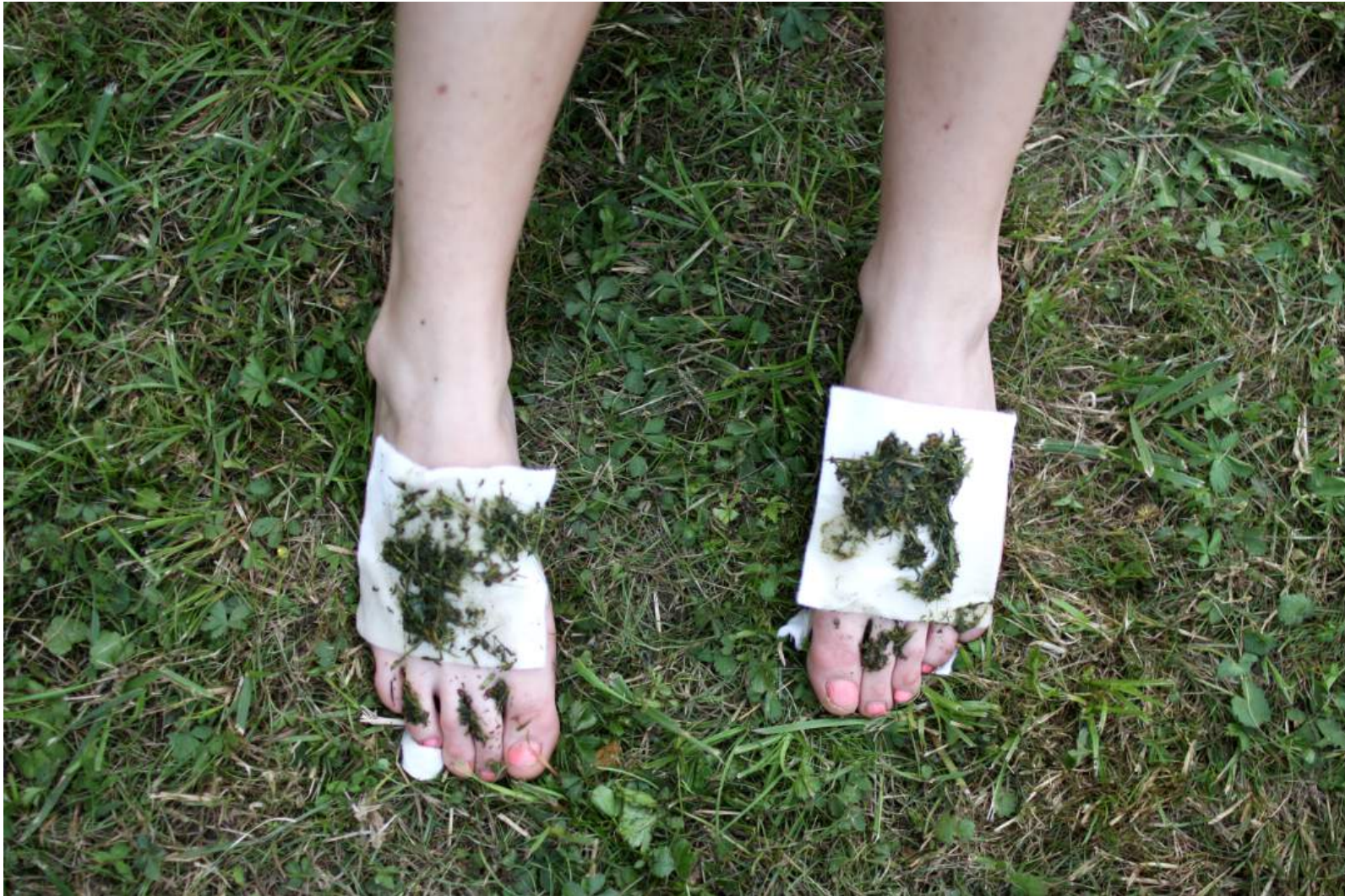
EPIDERMA_workshop, Stupinigi Park, Nichelino (Turin), June 2014