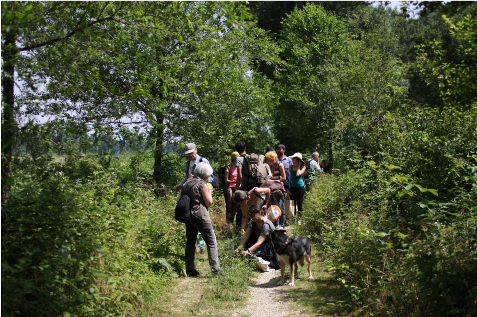
EPIDERMA - workshop at Stupinigi Park, Nichelino (Torino), June 2014