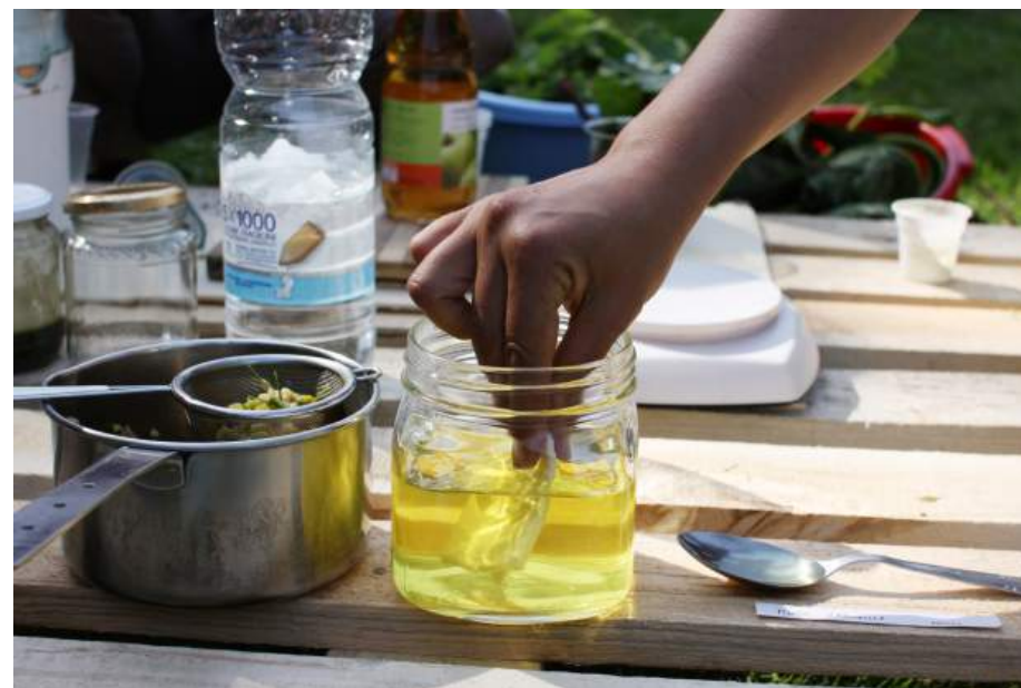
EPIDERMA - workshop at Stupinigi Park, Nichelino (Torino), June 2014

transformation of the plants and preparation of products suitable for human skin